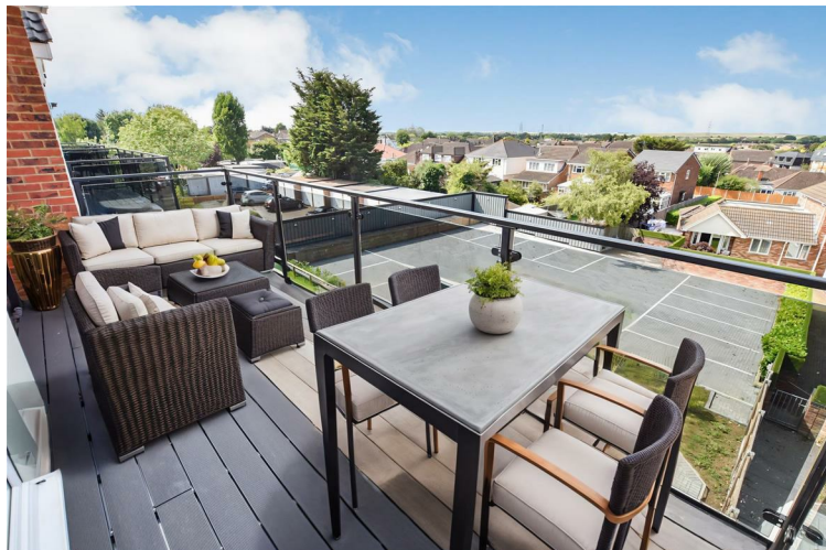
Large balcony with with far reaching views, composite decking and tinted glass balustrade,